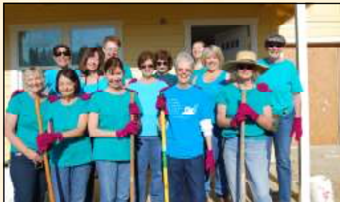
CNL Member: American Association of University Women

VISION: The varied programs and services of CNL enable member organizations to fulfill their individual missions, achieve national standards of excellence, strengthen board and staff skills, inspire public confidence and support, and provide collaborative leadership.