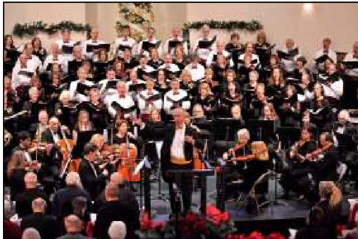
CNL Member: InConcert Sierra