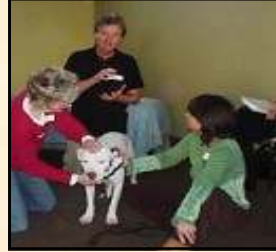
CNL Member: AnimalSave