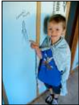
CNL Member: Habitat for Humanity