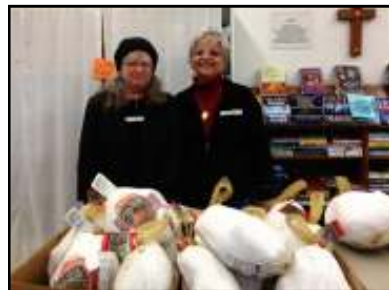
CNL Member: Interfaith Food Ministry